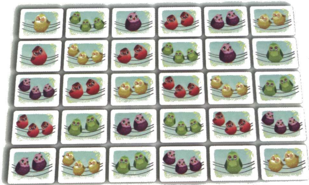
EXAMPLE OF RECOMMENDED FIRST GAME SETUP

Shuffle all the Bird cards and place them on the table, in such a way that no cards are covered. A grid of 5 rows of 6 Bird cards is recommended for your first game.