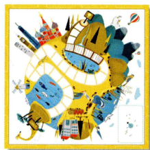
1 game board