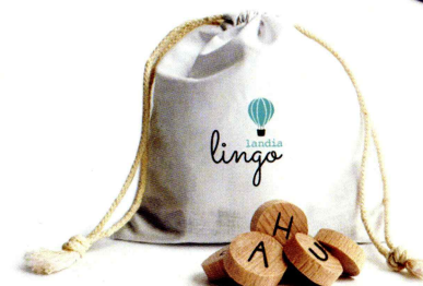
1 bag with lettered playing tiles

Do you want to torment your brain cells, develop the imagination, expand your vocabulary, connect contexts to fulfil the task? Welcome to Lingolandia. The game is intended for two to eight players of all ages who want more from a game. Based on natural competition, players will improve their spelling and awareness of the first letter of each word used, expand their vocabulary not only in their mother tongue but also in a foreign language and learn to use and logically combine all the knowledge they have ever learned.