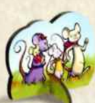
1 Mouse standee