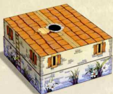
1 House box