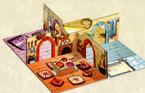
1 Floor board (walls and 3D elements included)