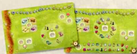
2 double-sided Question boards