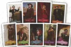
9 CHARACTER CARDS